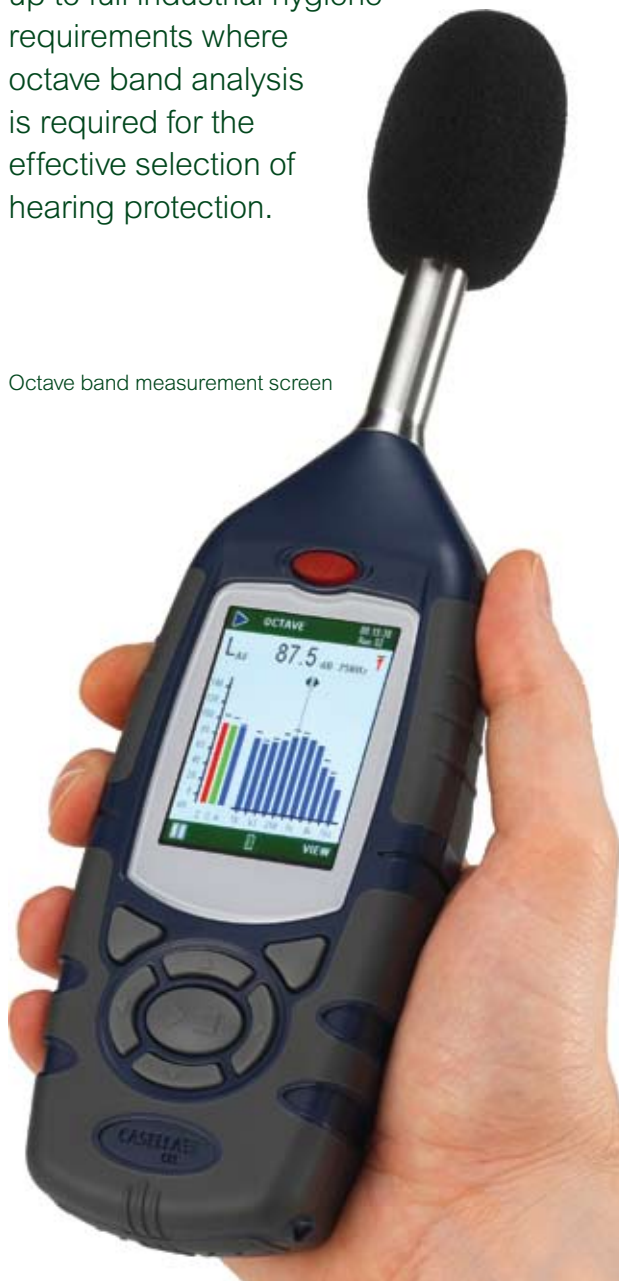
Octave band measurement screen

Different models are available depending on your requirements for use in general workplace noise measurements, up to full industrial hygiene requirements where octave band analysis is required for the effective selection of hearing protection.